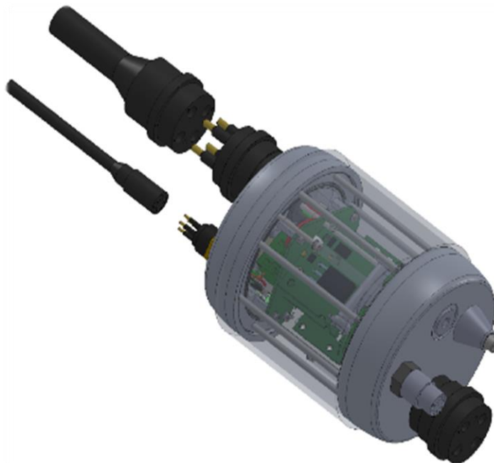
Stand-alone Motor Controller (SMC) Sizes will vary depending on depth.

Recording of lifetime performance data including total shaft revolutions, hours since overhaul and power cycles provide data points for operation and maintenance purposes are standard.