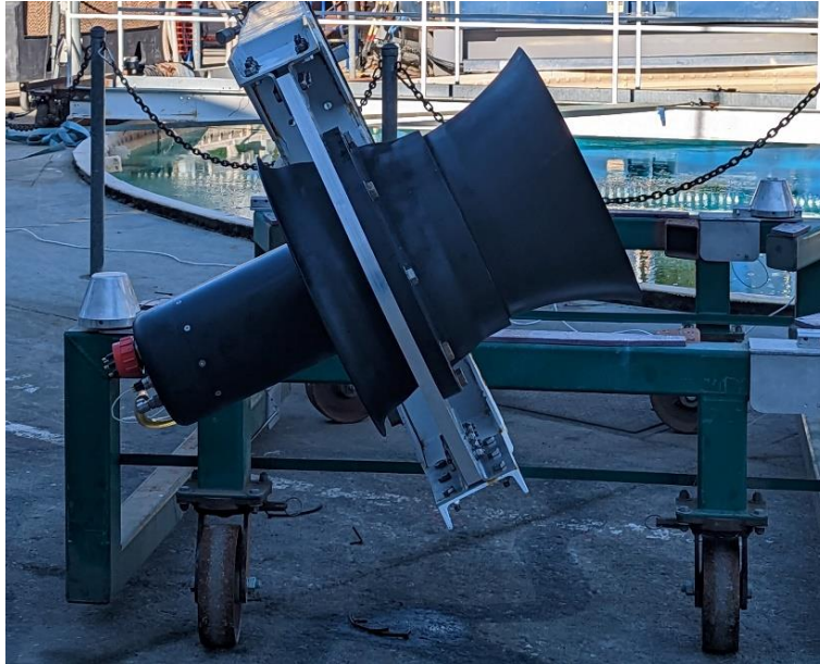
1002-1.23-19750XLR shown above.

All Innerspace thrusters are independently tested.