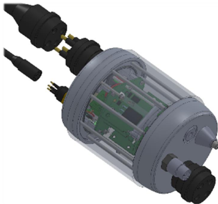
Stand-alone Motor Controller (SMC) Sizes will vary depending on depth.

Recording of lifetime performance data including total shaft revolutions, hours since overhaul and power cycles provide data points for operation and maintenance purposes are standard.